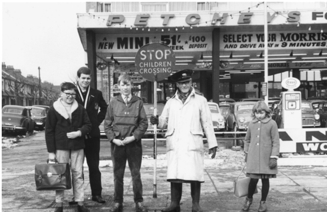
Crossing patrol, Barking Road. 1965