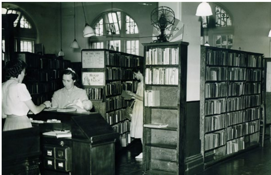
Manor Park Library-interior. 1946