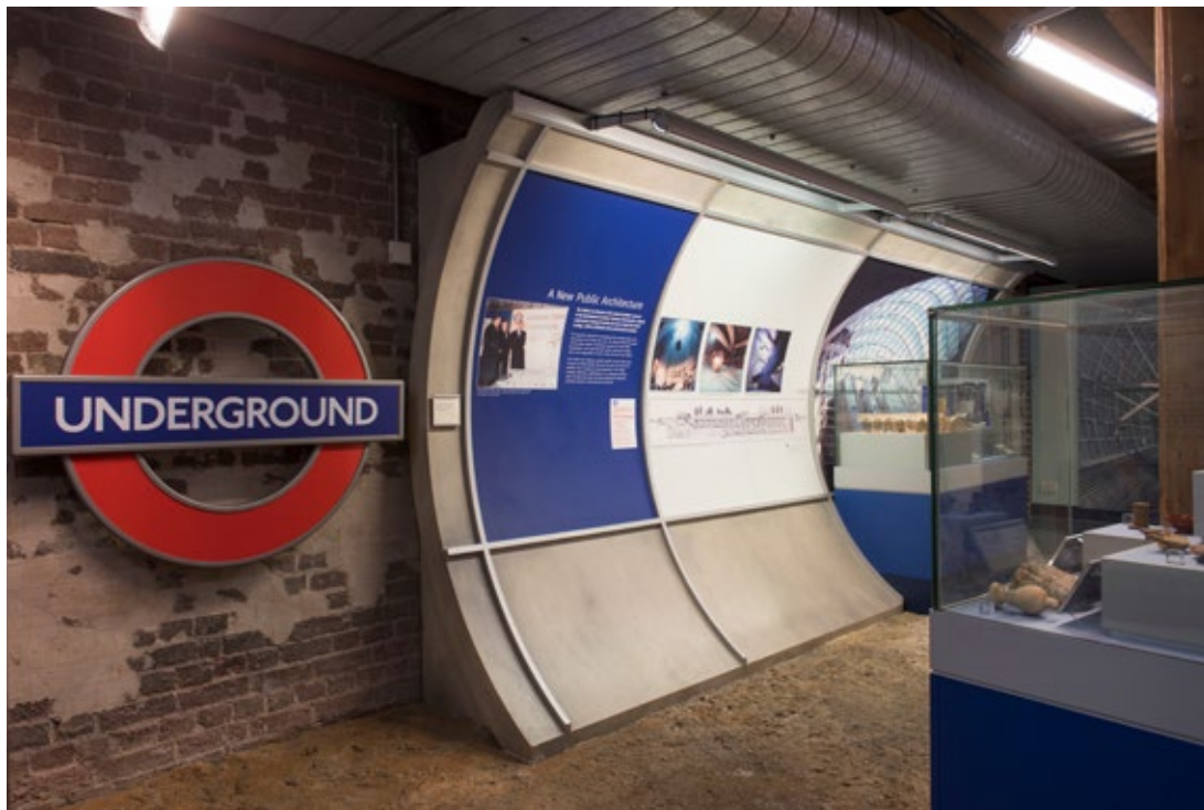
Reconstructed underground station