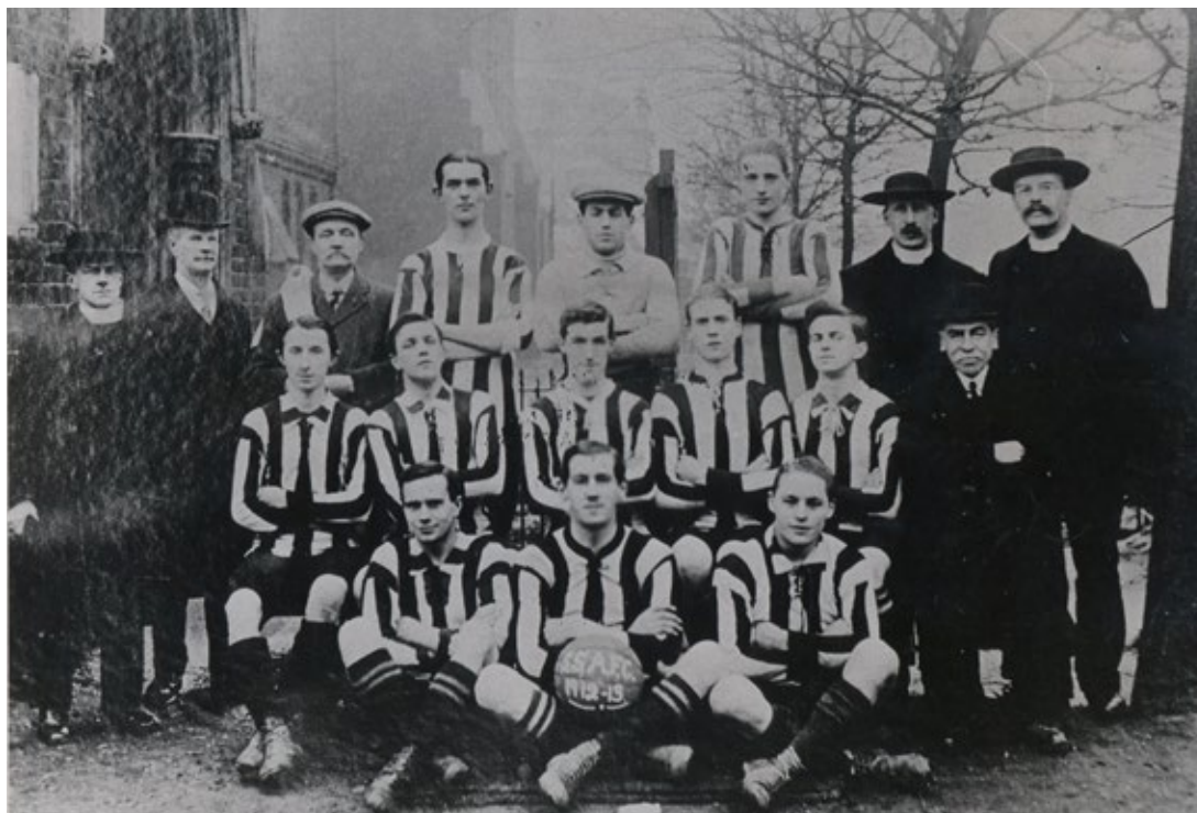
SS AFC (St Stephen's, EH). 1912-13