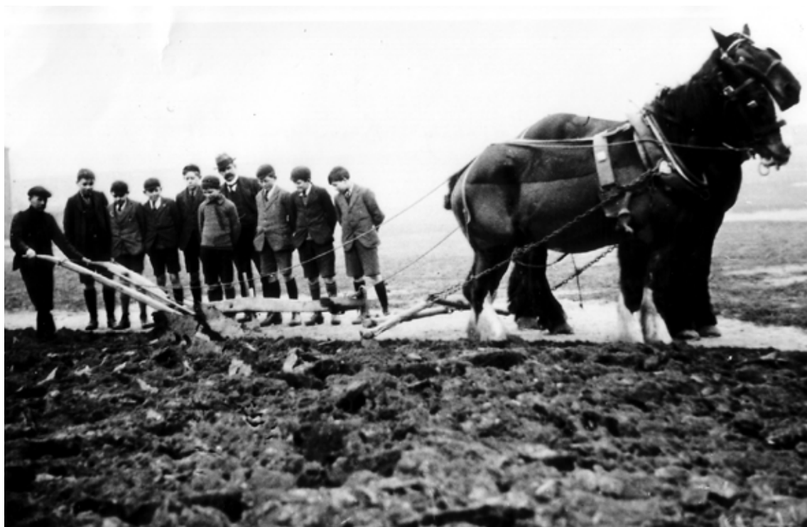
Ploughing in Brampton Park