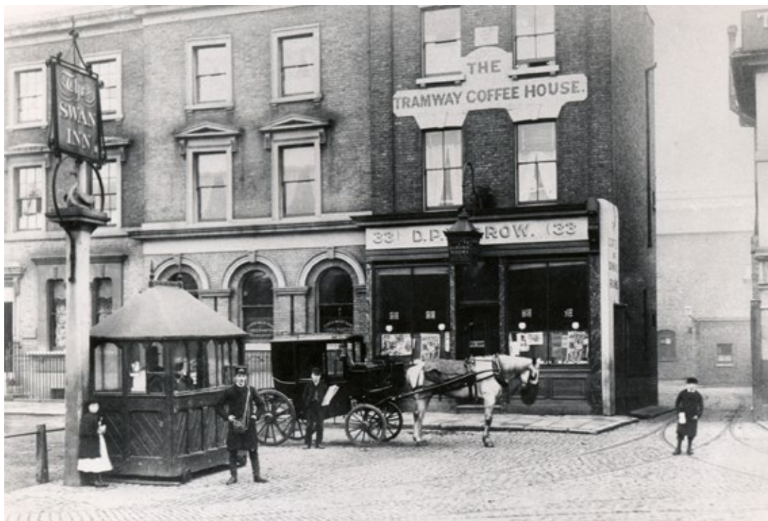
Stratford Broadway. c1904