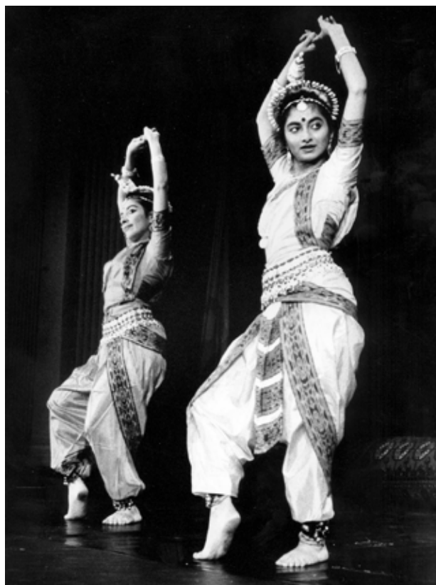
Banerjee Sisters, Gandhi Weekend Celebrations, Old Town Hall, Stratford. 16 Nov 1991