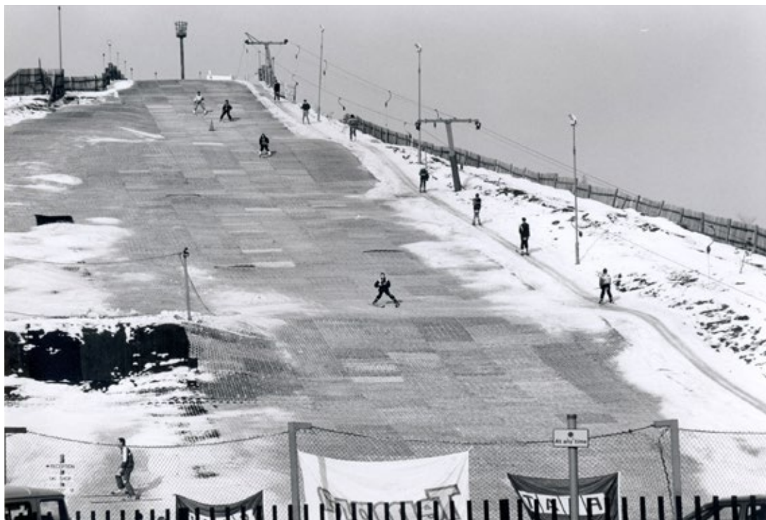
Beckton Ski Slope. Skiing on Beckton Alps during a spell of snow. 14 Feb 1991