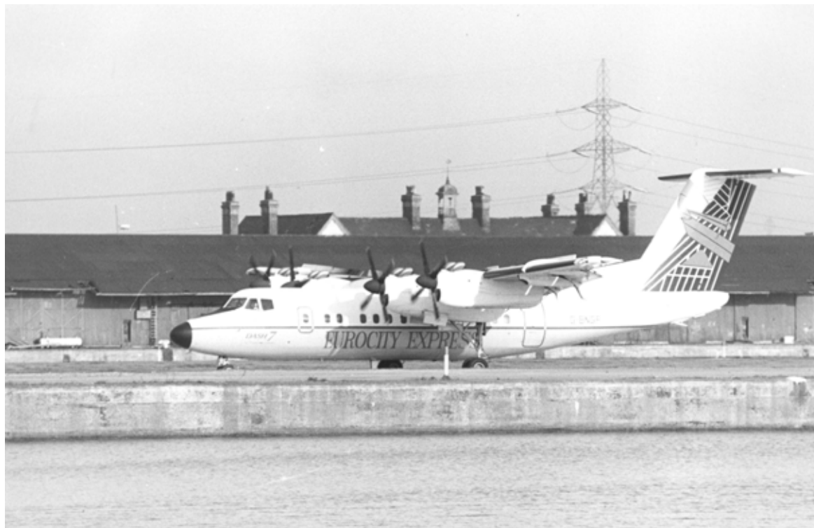
London City Airport. Dash 7 Eurocity Express on runway. November 1987