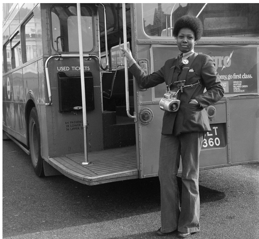
Female bus conductor