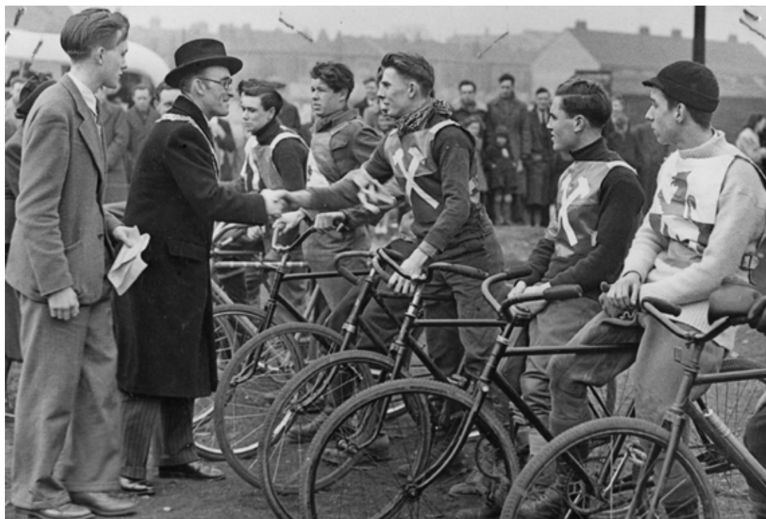
All London Cycle Speedway Grand Prix at Stratford. Mar 1949