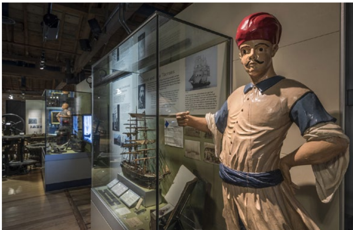
Turkoman, figure from Turkey