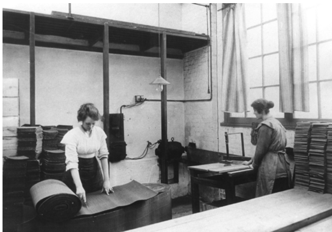
Jeyes Ltd. Corrugated cardboard cutting machine. c1918