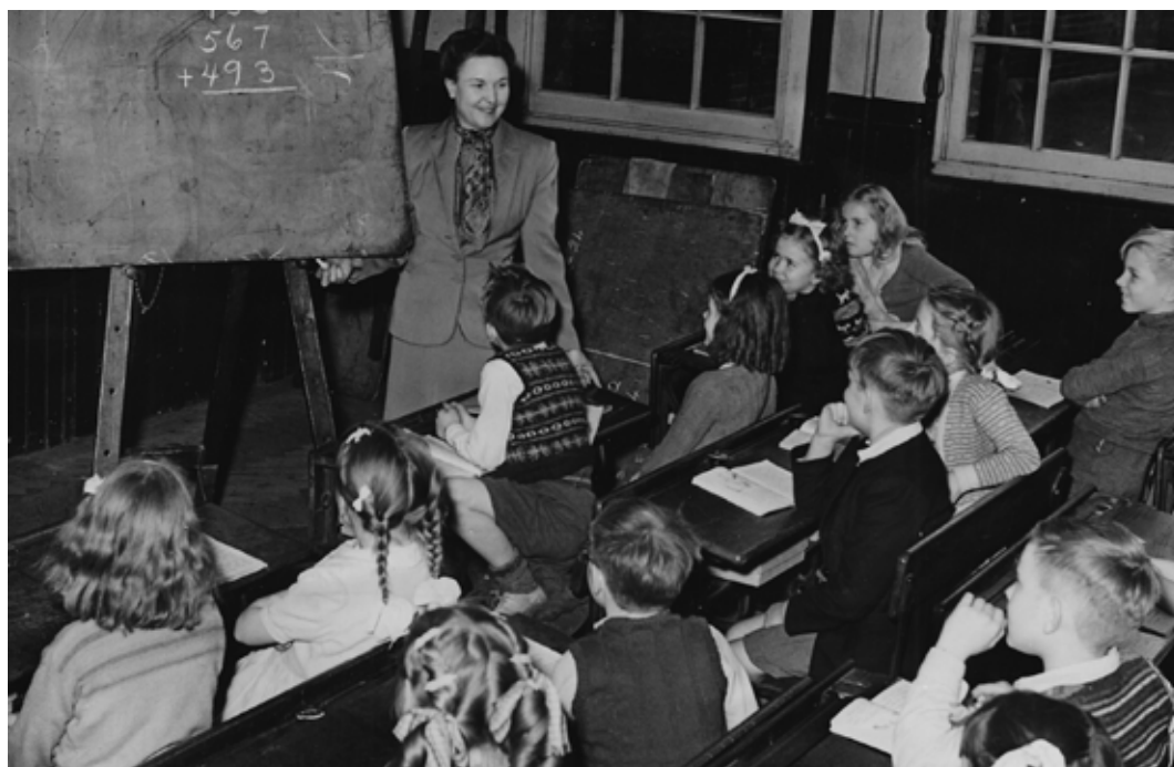
Miss Wilkey of Long Beach, California, teaching at West Ham Church School during an exchange visit