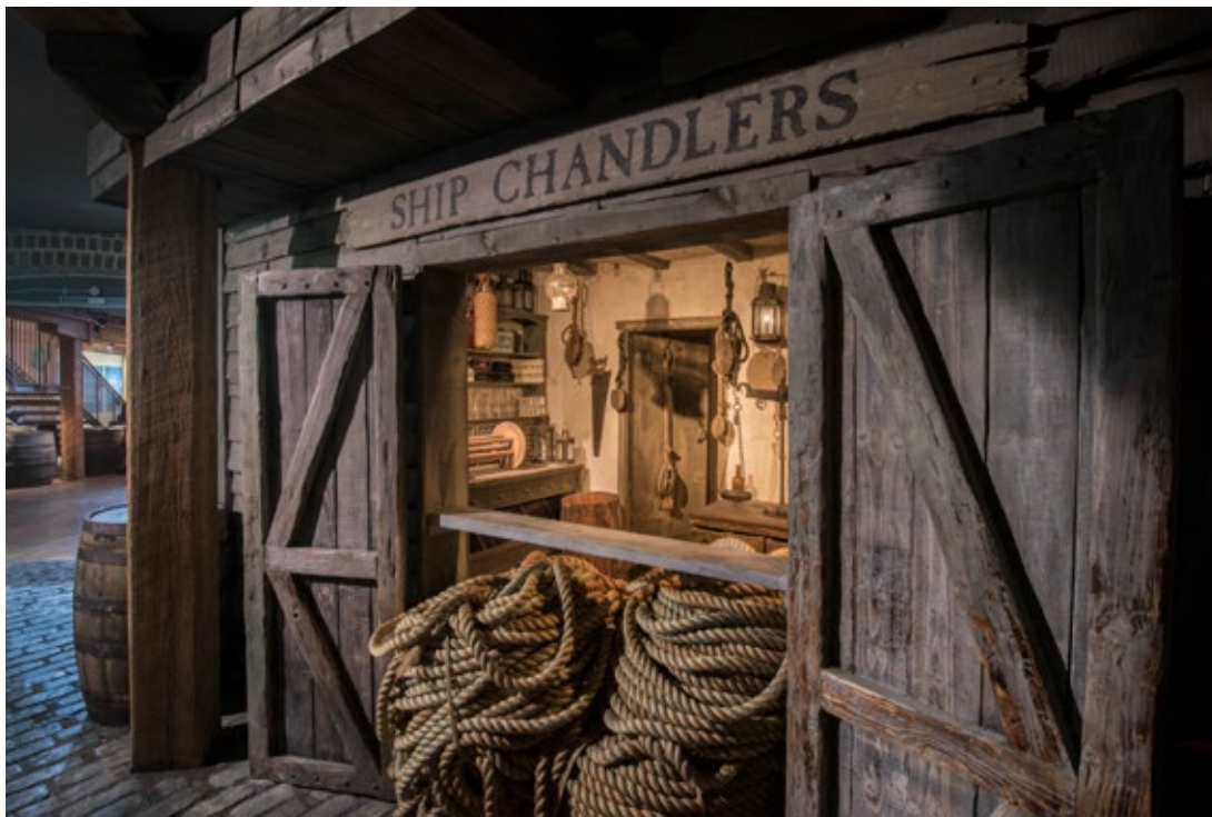
Recreation of a Ship Chandlers