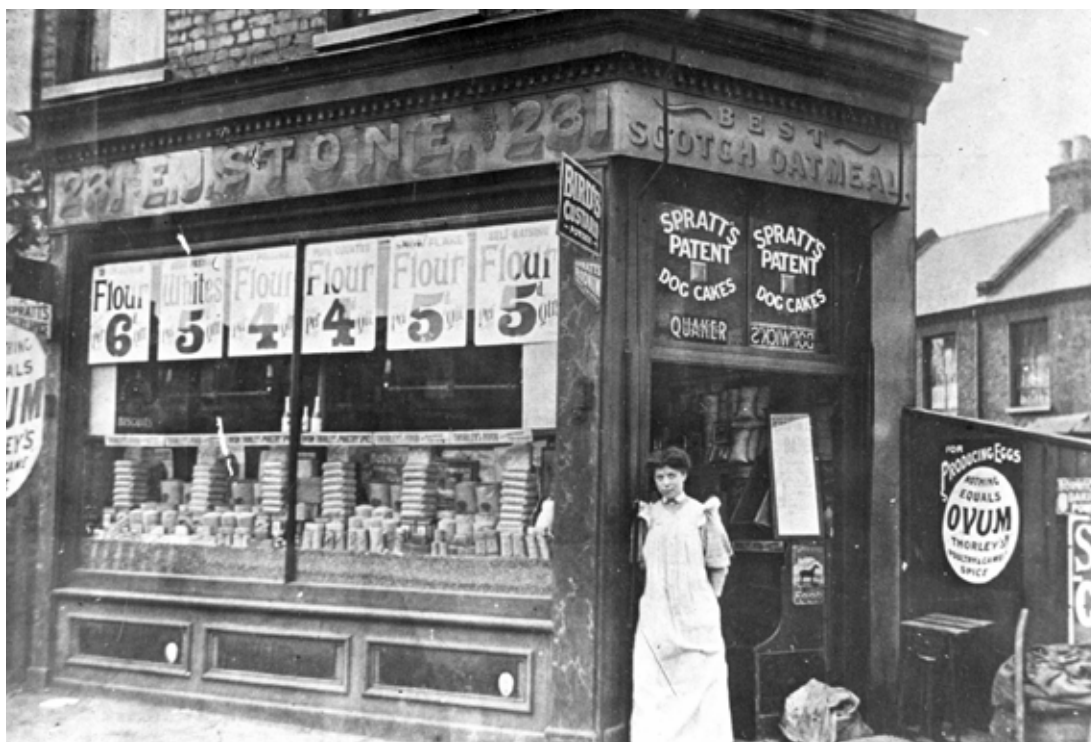
231 Barking Road c1895