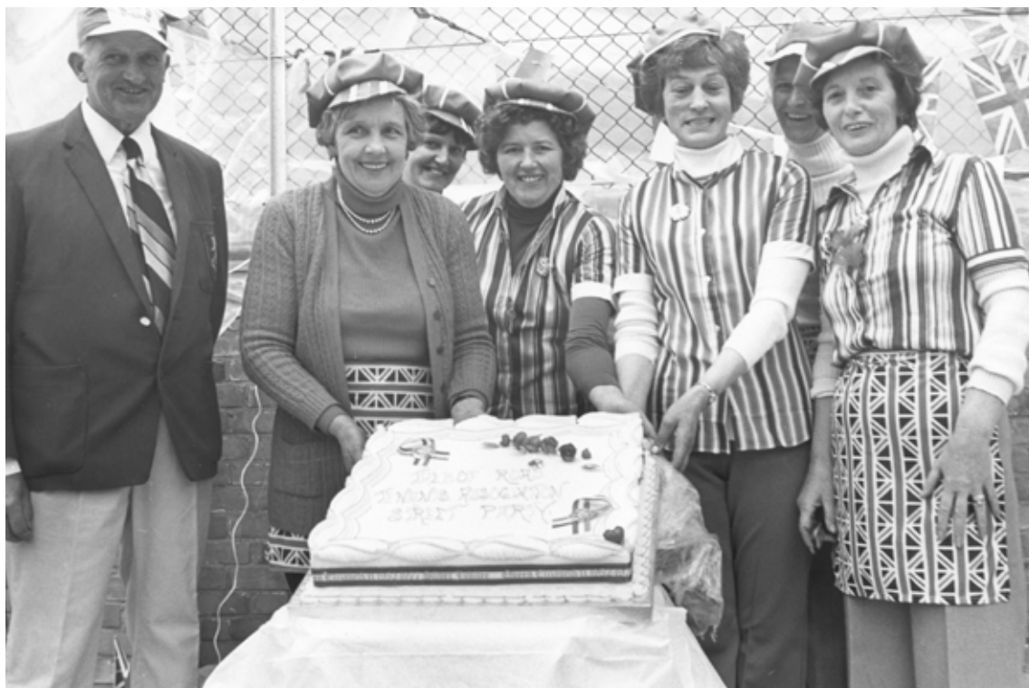
1977 Silver Jubilee. Talbot Road, East Ham.