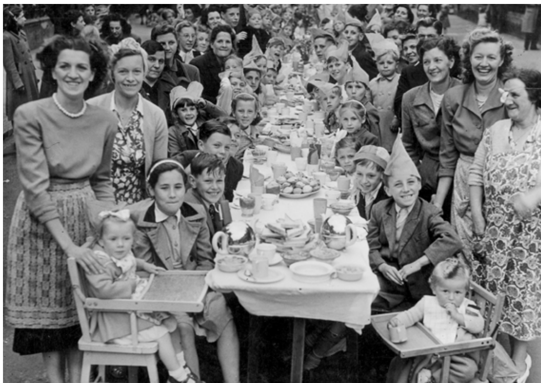
1953 Coronation. Chandos Road, Stratford New Town