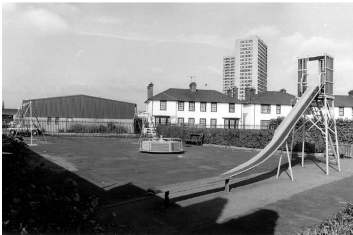
Lyle Park. October 1986