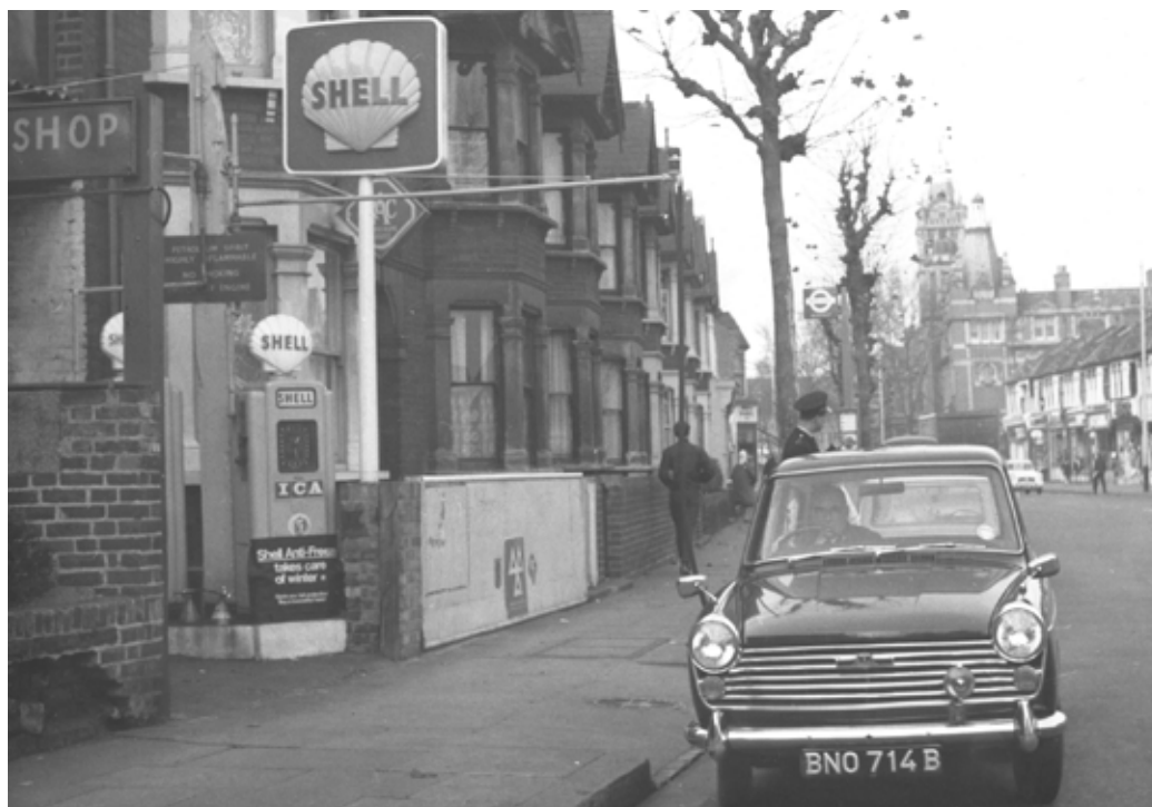
High Street South, East Ham. 1966