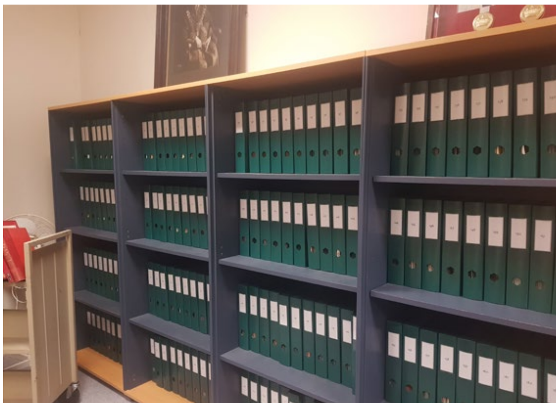
Box files in the archive