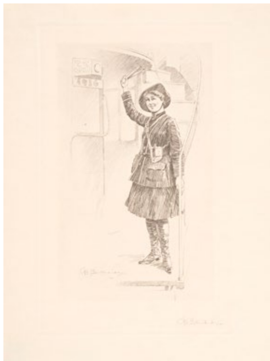
A London bus conductress. Etching by George Studdy