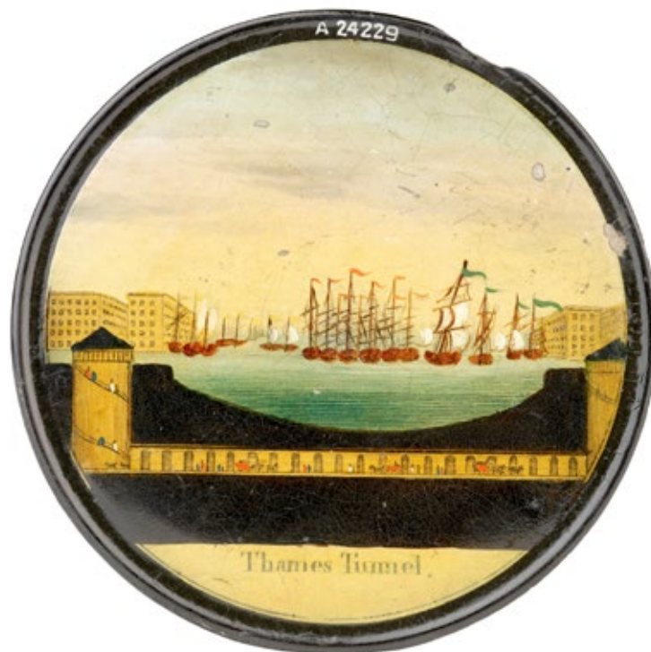
Commemorative snuffbox showing the Thames Tunnel