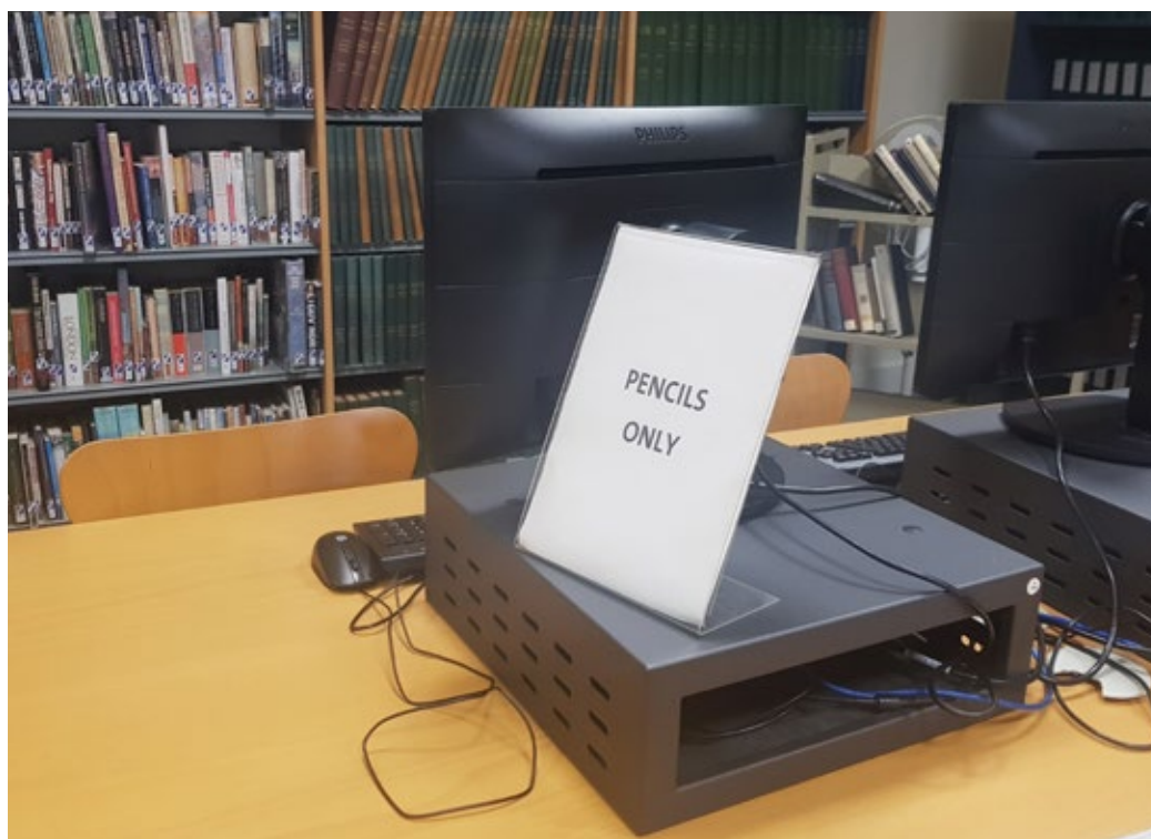
Pencils only, in the archive