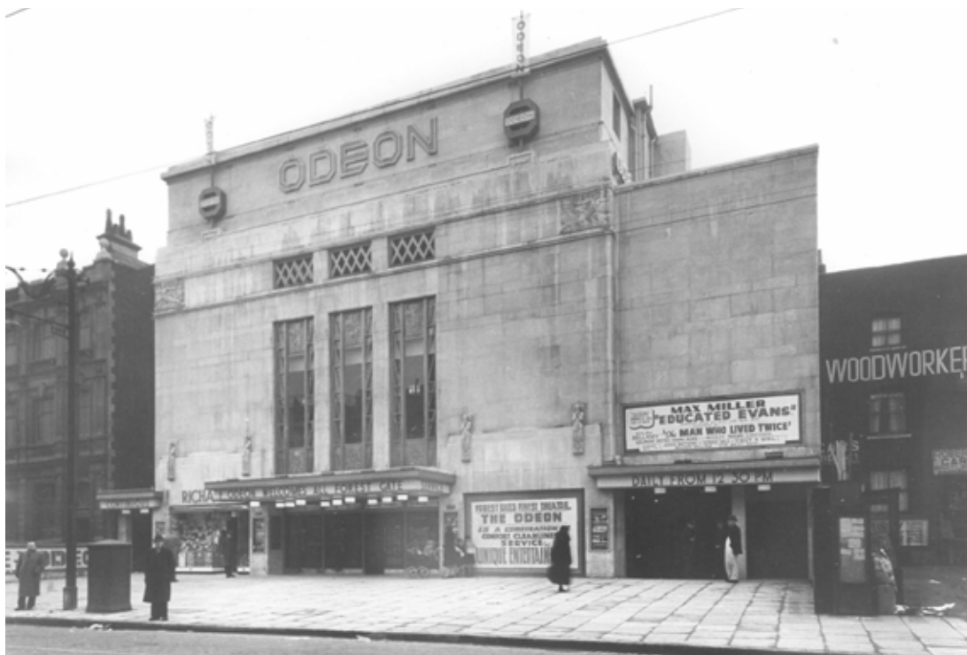
Odeon, Romford Road. c1936