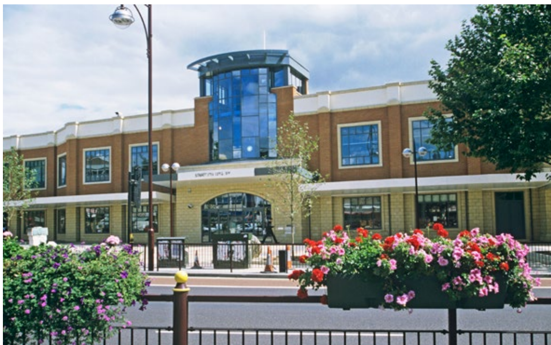
Stratford Library–Opened 2000