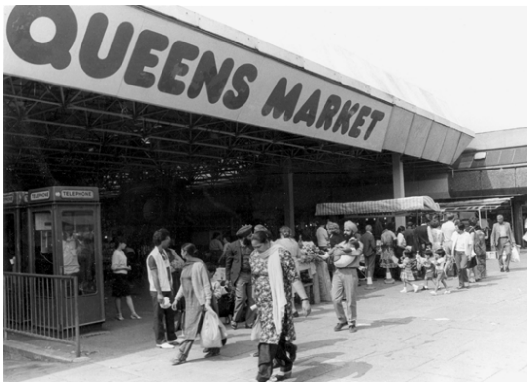
Queens Market, August 1984