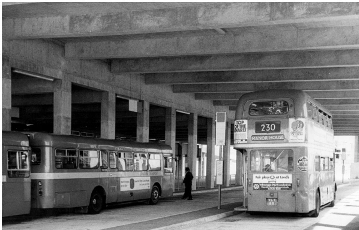
Stratford Bus Station. 16 June 1973