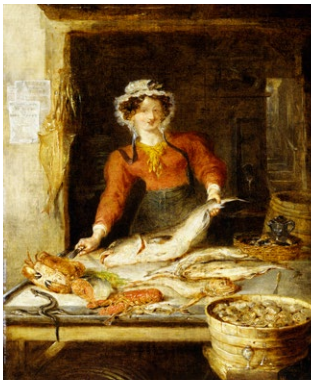
The Fish Stall c. 1830 by William Kidd