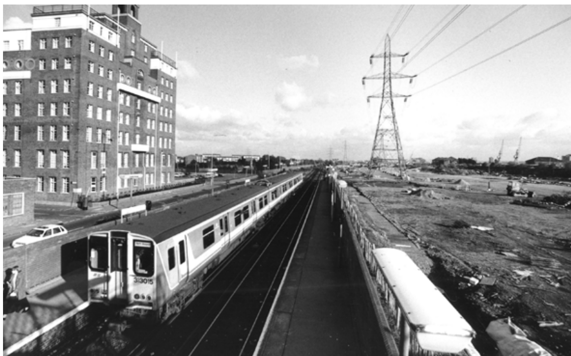
Docklands Light Railway. Construction of Beckton extension. View from Custom House Station looking east. 5 November 1990