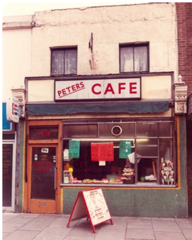
Peters Cafe, 359 Barking Road, E6. April 1985